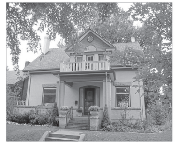
765 Humboldt $789,000