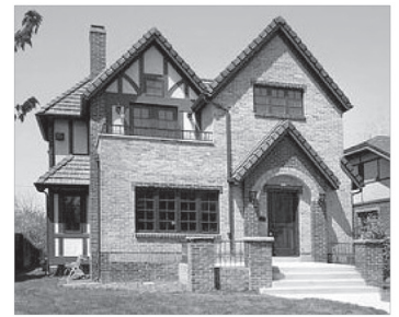
Wash Park, coming in October!

I've run out of SOLD signs... ***all SOLD this year***