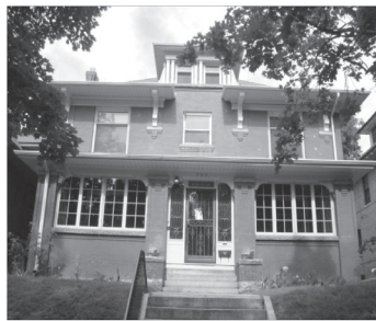
735 Emerson $785,000