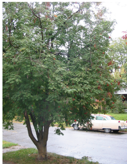
One of few European Mountain Ash trees in Congress Park, 1000 block of Garfield St.

The birds sure know where they are. Do you? The showy orange red fruit of the European Mountain Ash is a favorite food for some birds and eye-candy for passersby. While not common in the neighborhood, Sorbus aucuparia is a popular ornamental tree throughout the country. It is decidedly happiest in cool climates, but otherwise isn't well suited to our sunny hot summers and dry, compacted alkaline soils. Poor growing conditions make the trees particularly susceptible to a battery of diseases and insects. Like so many of the exotic tree species planted in Denver, none-