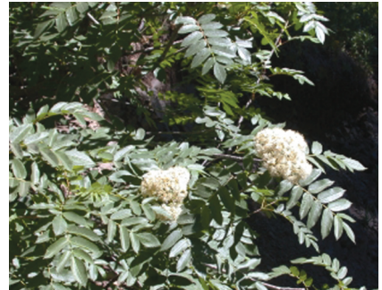
Our native Mountain Ash in flower

Taken by the features of the European Mountain Ash, but would like a plant with more local roots?