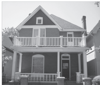
1333 Lafayette $419,000