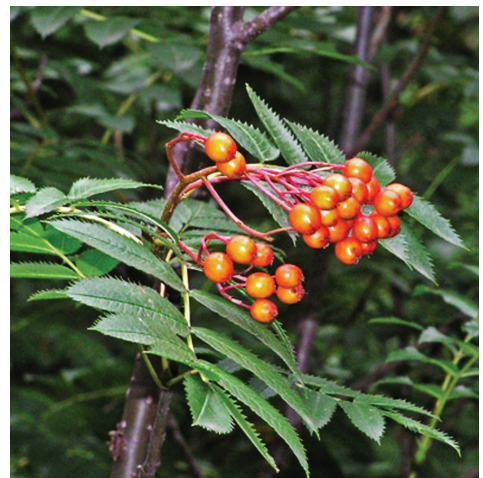
Our native Mountain Ash's fall color and fruit

In the meantime, take the root of its Latin name aucupor to heart and "go bird-catching" to see if you can find other European Mountain Ashes in fruit around the neighborhood...before the birds seek them out for winter food. If you are even more adventurous, pick a few for yourself to steep a warm cup of tea.