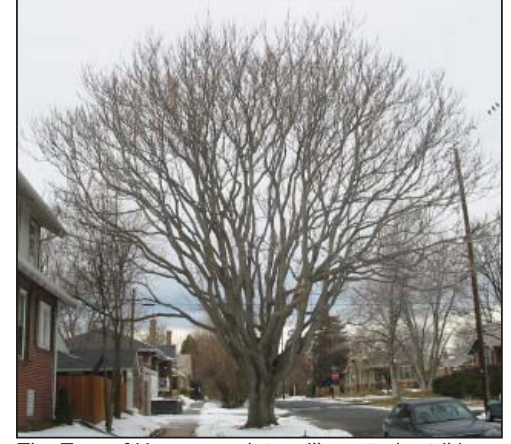
The Tree of Heaven's winter silhouette is striking.

10. American Elm – 1020 Garfield St. The majestic American elm at 1020 Garfield St. is appropriately nicknamed "The Monarch" by its longtime devoted owners. Winter 2009 issue, p. 12.