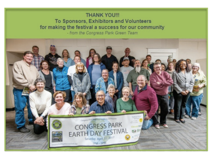
CP Earth Day exhibitors pose for the thank you photo after the event.

As well as the annual Earth Day Festival, we do have activities all year round, so please reach out if you'd like to work directly on or with our team. The Green Team is in it for the long haul so we look forward to working together for years to come!