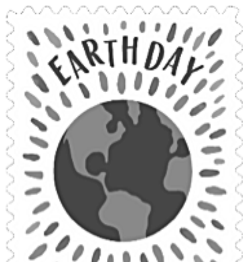
This year marks the 50th anniversary of Earth Day and the USPS is premiering a new stamp in celebration.

We're in Mother Nature's Season of Surprises, when she may drop an inch or a foot of snow with very little warning. Keep that snow shovel handy and make sure people can walk or wheel up your block safely. Is your neighbor out of town? Shovel their section, too, and ask if they can clear your walk when you're gone. Have a neighbor who never shovels? Find out why and offer to help.