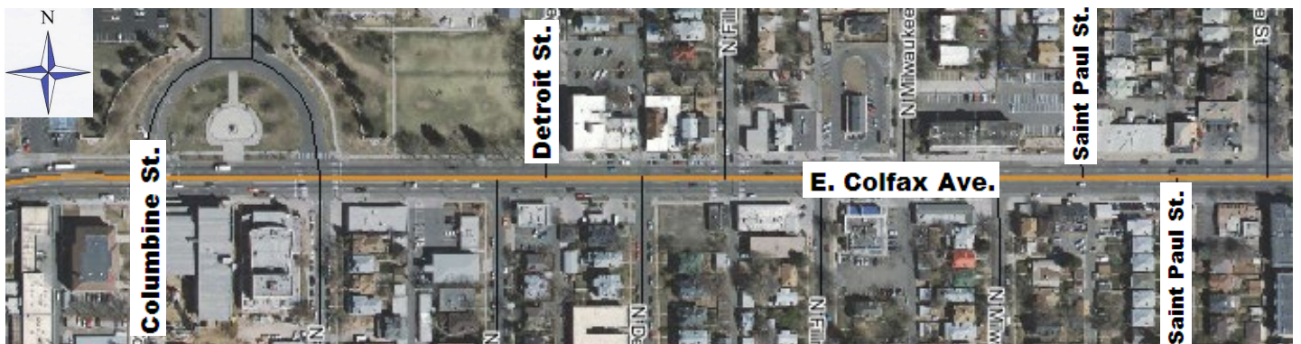
The District is located along the north side of East Colfax Ave. from Detroit St. to Saint Paul St.; and along the south side of East Colfax Ave. from Columbine St. to Saint Paul St.